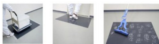
Eco Clean Adhesive Mat