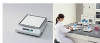
Temperature control heating plate