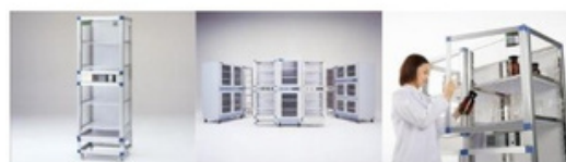
Auto Dry Desiccator