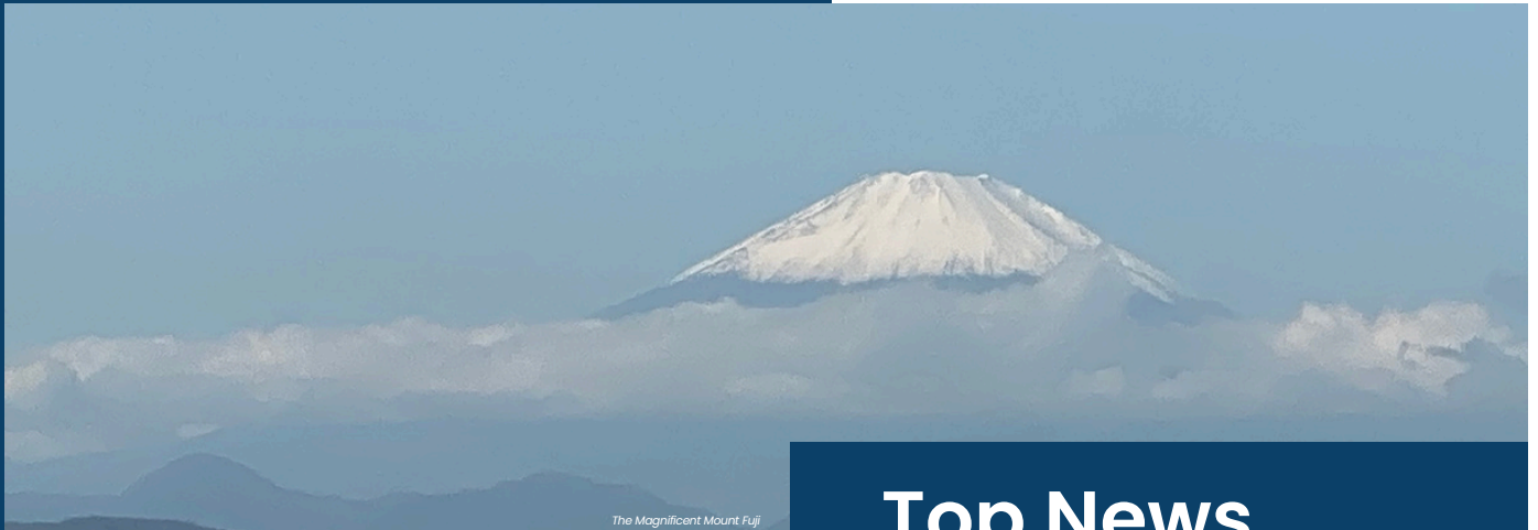
The Magnificent Mount Fuji